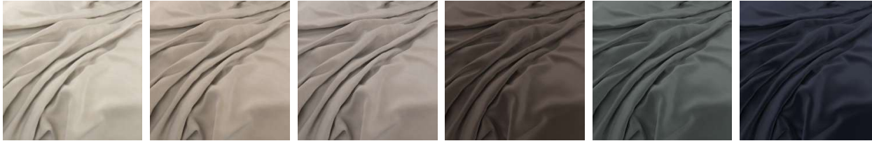
Bone Platinum Fog Cinder Hague Blue Ink