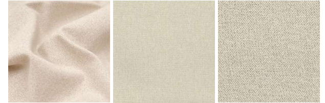
Linen (Faux Wool) Clay (Flat Weave) Malt (Chenille)