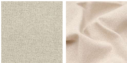
Malt (Chenille) Linen (Faux Wool)