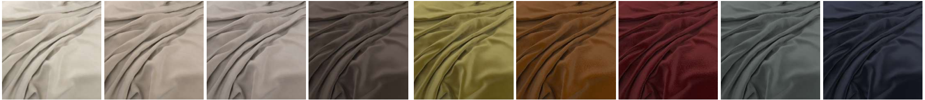
Bone Platinum Fog Cinder Moss Gingernut Ruby Hague Blue Ink