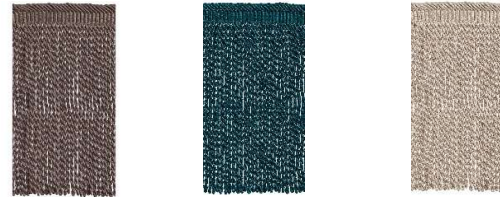
Bronze Hauge Blue Dove