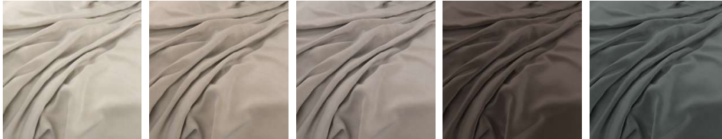
Bone Platinum Fog Cinder Hague Blue